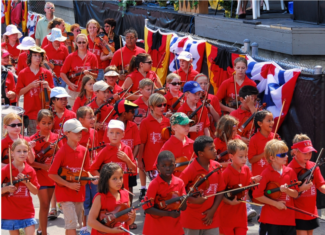
March of the Violins Top Choice by Judge Wolfgang Koger