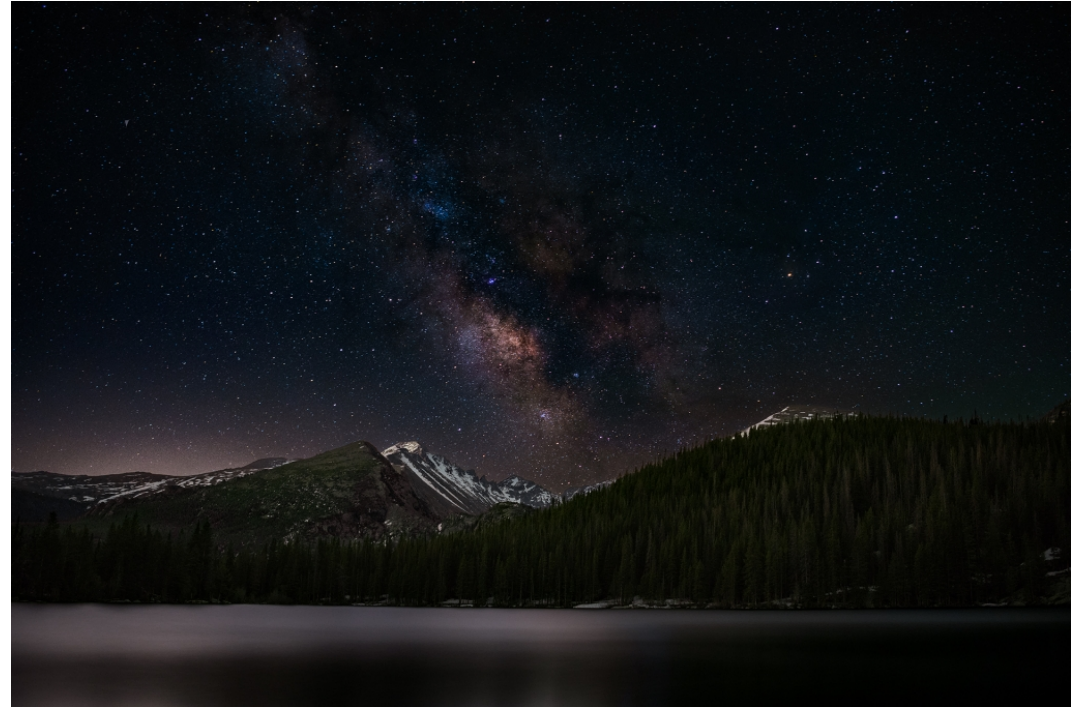
Longs Peak and Milky Way First