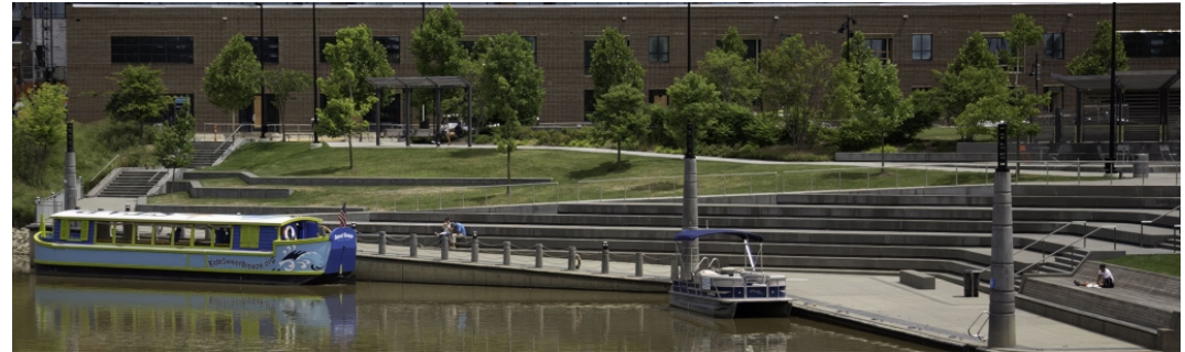
The Riverfront at Promenade Downtow