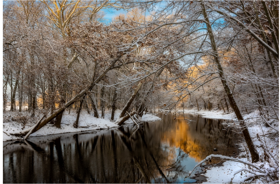
Snowy Sunrise on the Wabash