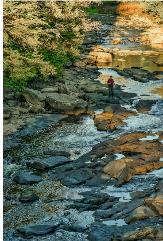
Chasing the Light