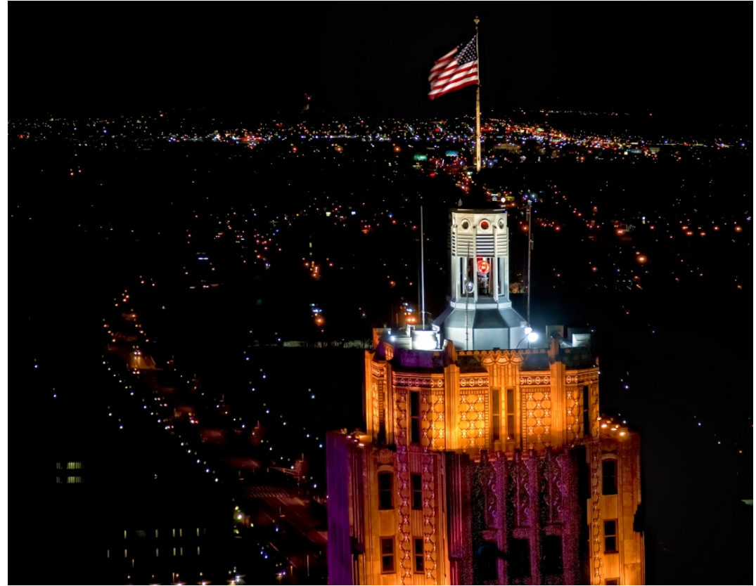
Flag Above Lincoln Tower First Denise McQuillan