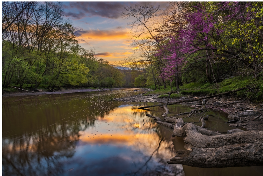
Salamonie River in Spring