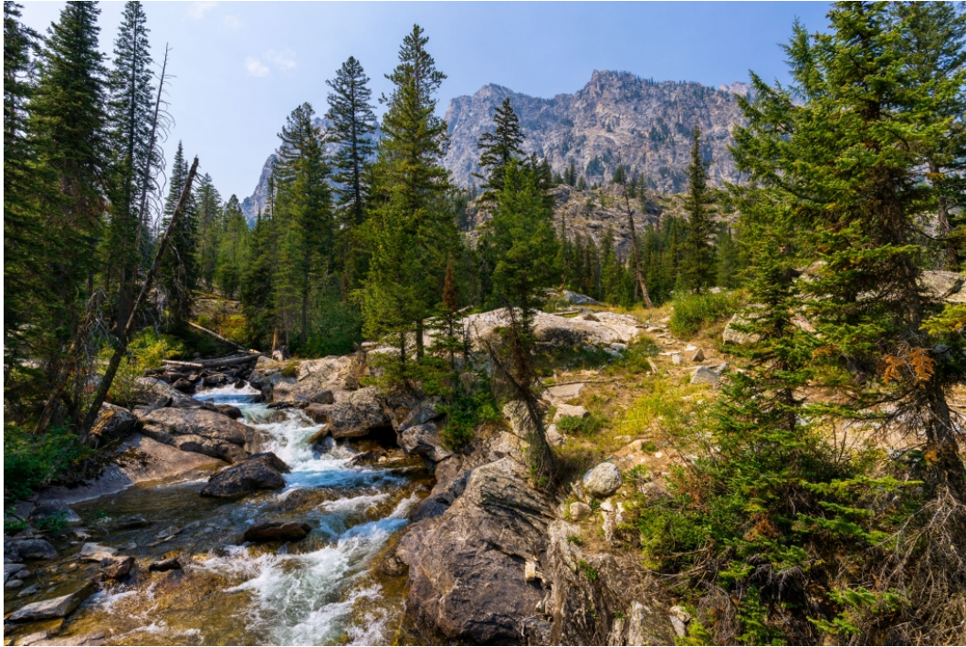
Teton Valley White Water