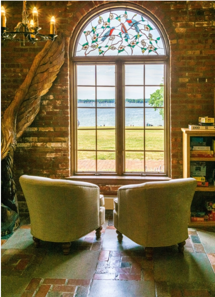
Enjoy the View