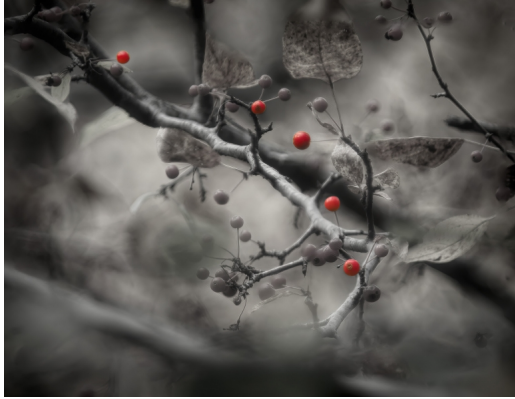
Crab apple tree detail Honorable Mention Bill Christie