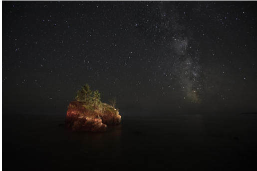
northshoremilkyway Honorable Mention Lawrence Gaskill