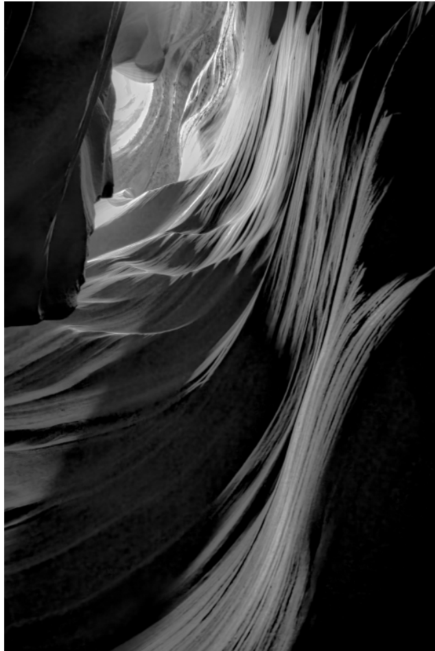
Antelope Canyon Top Choice by Judge Wolfgang Koger